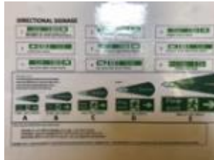
X-Fire exit signage 2018010.jpg