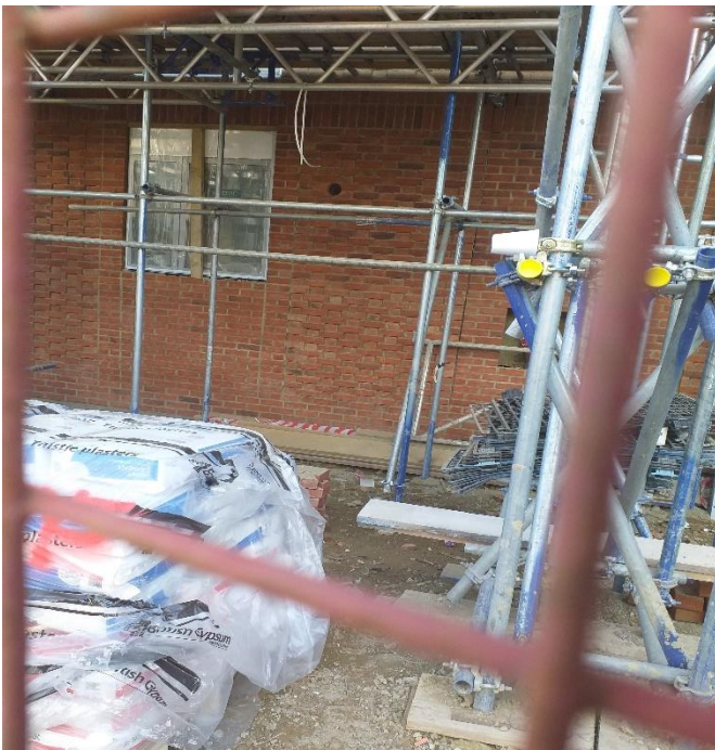
Windows being installed at Harold Moody Court