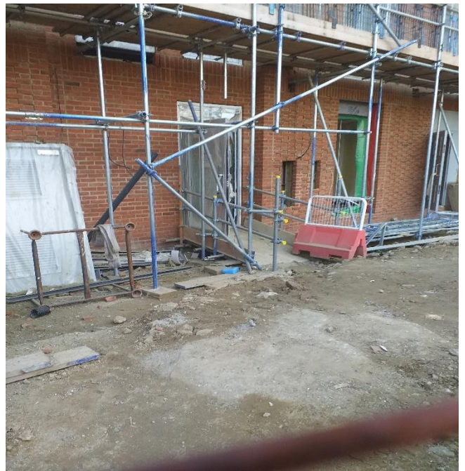
Works on the Front Door to Harold Moody