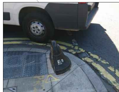
NEW HALF BELL BOLLARD