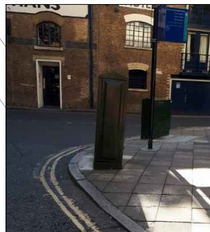
EXISTING UTILITY CABINETS TO REMAIN IN PLACE