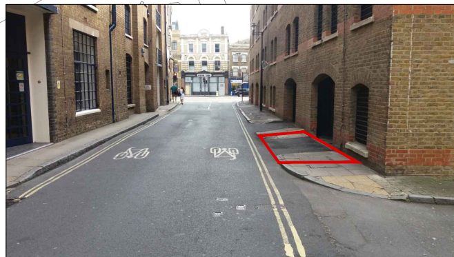
DROPPED KERB TO BE REPLACED WITH FOOTWAY ACROSS PEDESTRIAN ENTRANCE. VEHICLE ENTRANCE TO REMAIN DROPPED.