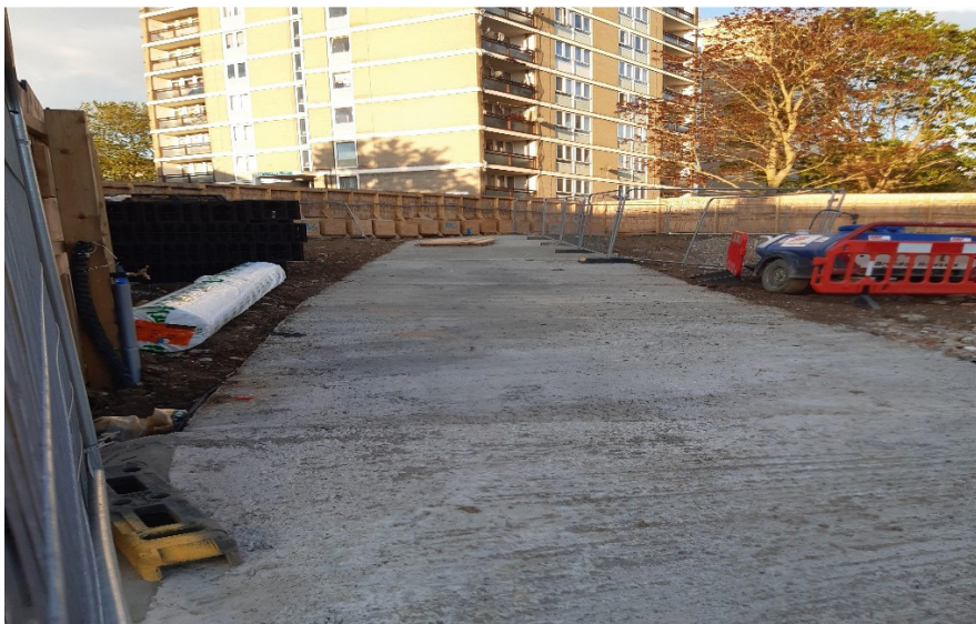
Breaking out of concrete slab and lower section of site piling mat

Over the coming weeks we will add a second layer of piling mat for the blocks. Drainage works outside the hoarding and adjacent to 2-32 Rye Hill Park will take place depending on Thames Water and their extended attendance schedule due to COVID-19.