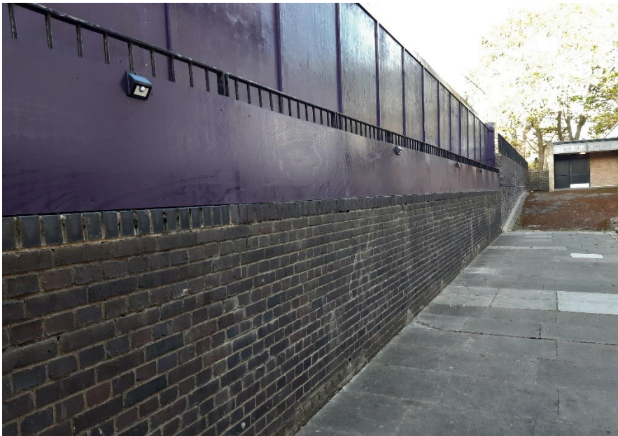
Additional lighting to hoarding

We will write to the residents of 2-31 Rye Hill Park separately and closer to the event, providing a full explanation of the works.