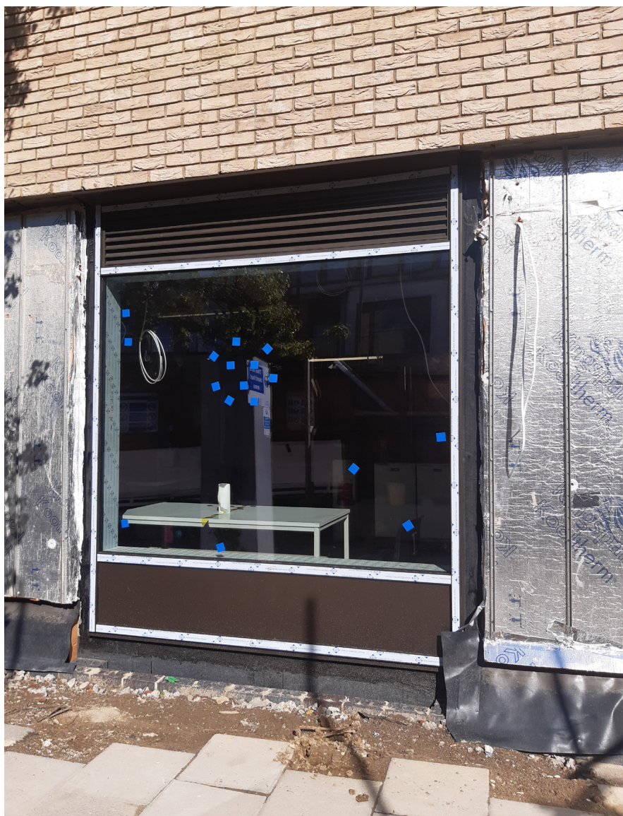
Curtain walling to the community centre - West Elevation

In July, we will start resurfacing the service road. Unfortunately this may be disruptive but we will ensure access and egress to 95-135 Meeting House Lane remains as open as possible. Where possible we will keep disruption to a minimum and we apologise for any inconvenience that will be caused to you whilst these essential works are carried out.