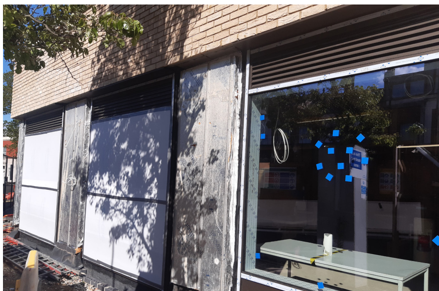
Curtain walling to the community centre - West Elevation

The scaffolding to the east elevation remains in place to allow us to finish the ground floor brickwork. The gantry on the west elevation has come down however we will need to re-erect the scaffolding in order to finish the brickwork on the last two balconies.