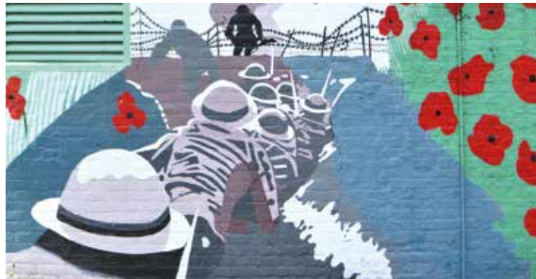
Rotunda Mural