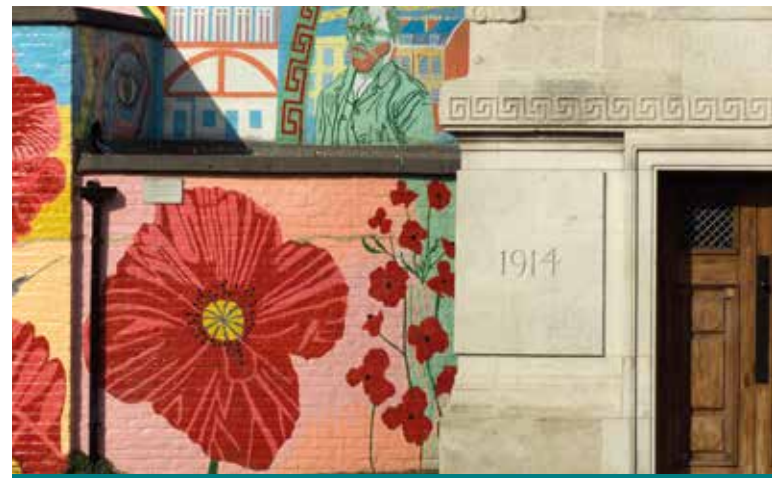
Stockwell War Memorial Clock Tower and Rotunda Mural

8 Brixton Murals, Bellefields Road This abstract artwork goes to show that not all murals need to have a hard hitting message. In 1987 residents asked for ‘birds, flowers and something non-political’. Lots of references to the local area can be found if you know what you’re looking for. The demolished Empress Theatre makes an appearance, as does an abstract impression of the local church. Names are played with too – what do you think the bell and pile of bricks represent?