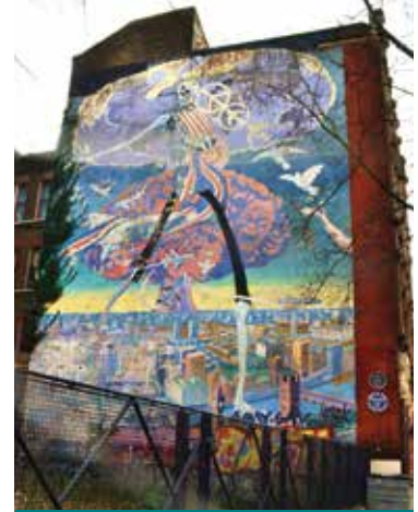
Nuclear Dawn Mural, Coldharbour Lane, Brixton

The mural holds a lot of detail, and it’s worth getting up close if you can. There’s even a mini version of this mural depicted amongst other landmarks of Brixton, political figures and images of peace.