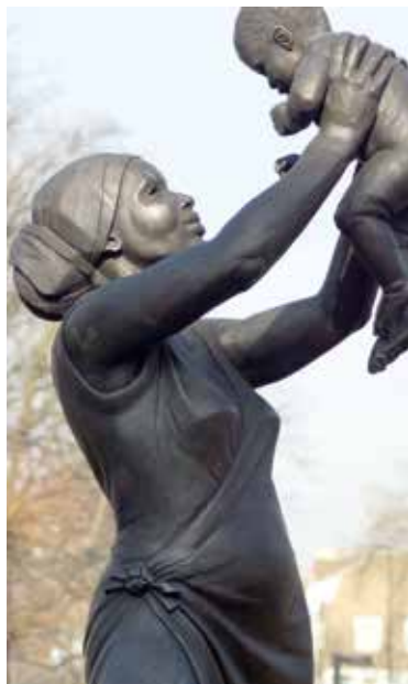
The Bronze Woman

The final building on Cormont Road is the smaller mansion block Dover House , named after the English town that gave sanctuary to the Minet family in the 1680s.