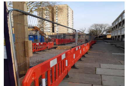
Hoarding removed of alterations - adjacent 2-32 Rye Hill Park