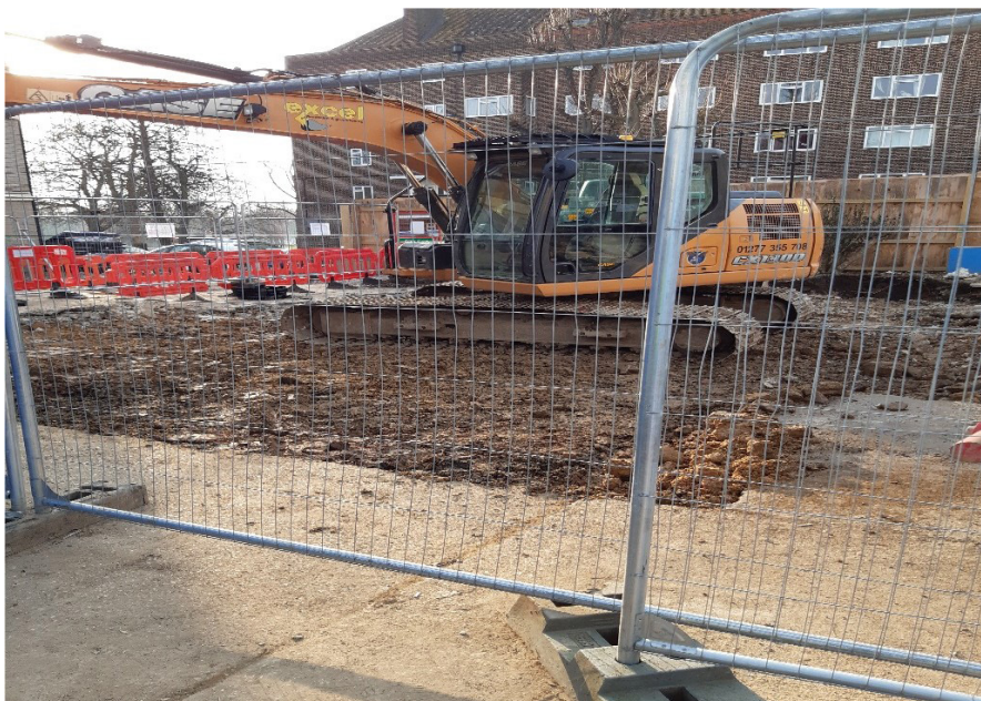
Reduce dig and slab adjacent Rye Hill Park

ENGIE is working in partnership with Southwark Council to build new council homes at Rye Hill Park. The project is due to complete in summer 2022.