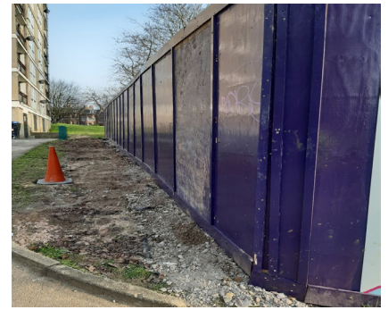
Hoarding alteration - north elevation