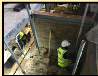
Lift shaft blockwork