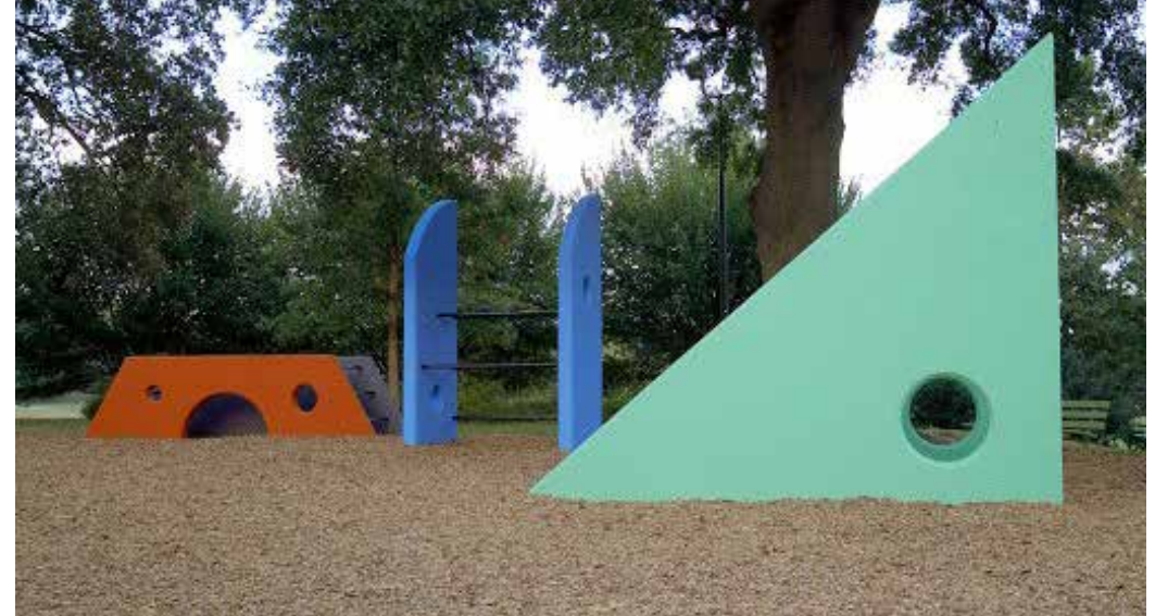
A range of play equipment, from natural to abstract