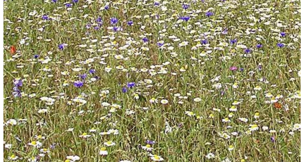
Wildflower meadow planting