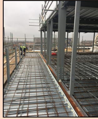
Conform floor panels fixed in place