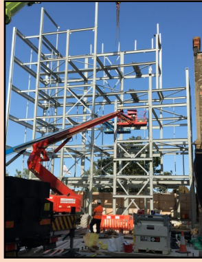
Steel Frame being erected