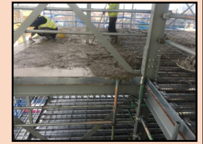
Concrete pumped to form floor slabs