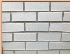
CREAM GLAZED BRICK