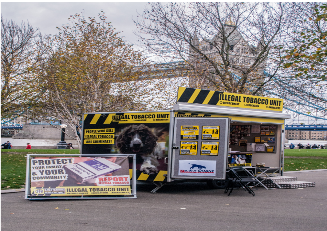
Photo: Keep It Out Campaign and sniffer dogs, Potters Field, November 2015