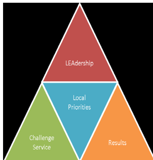
Figure 2: CLear Model