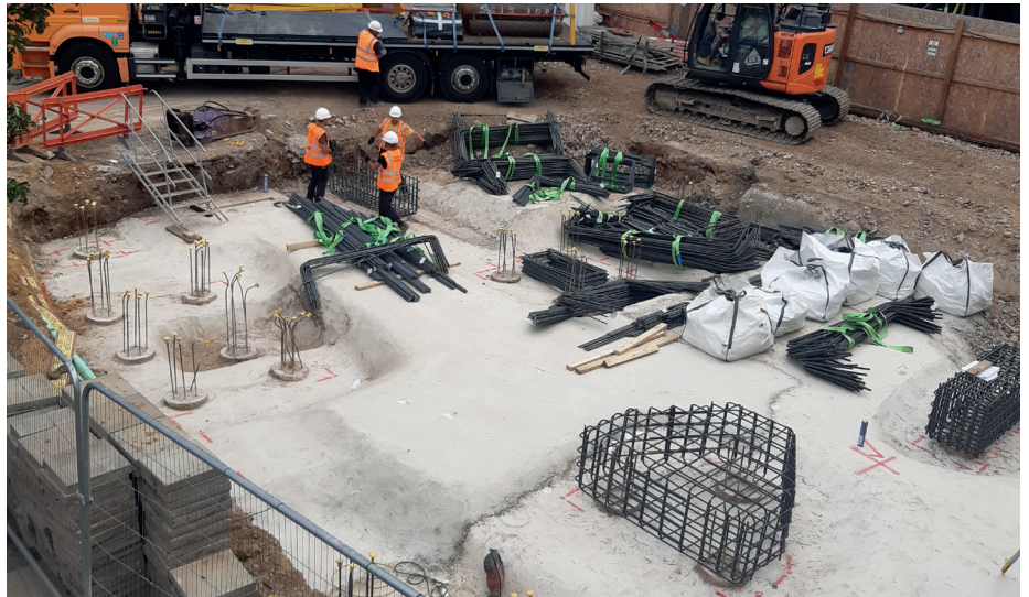
New community centre piling

As a reminder, to ensure we mitigate some of the delay caused by the COVID-19 lockdown and the need to maintain social distancing on site, we have been granted extended working hours (8am - 7pm, Monday to Friday and 8am - 5pm, Saturdays) by Southwark Council's Environmental Protection Team.