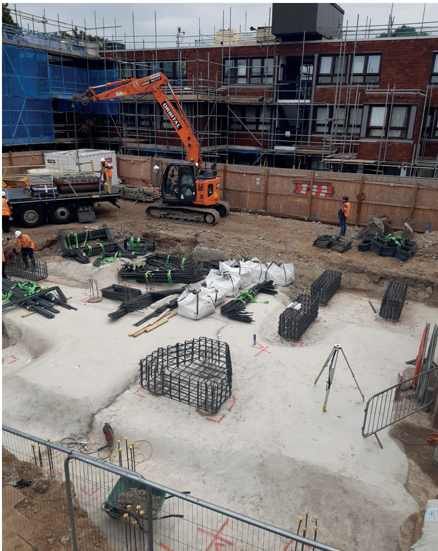
New community centre piling - Phase 2

ENGIE is working in partnership with Southwark Council to build new council homes at Meeting House Lane. Please see overleaf for the latest update on the works being undertaken.