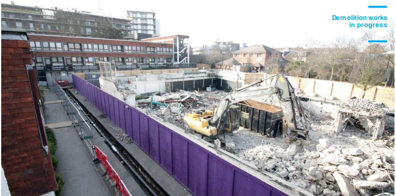
Demolition works in progress