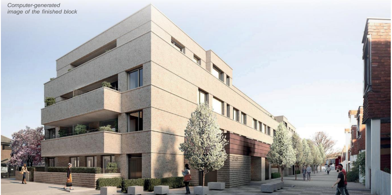
Computer-generated image of the finished block