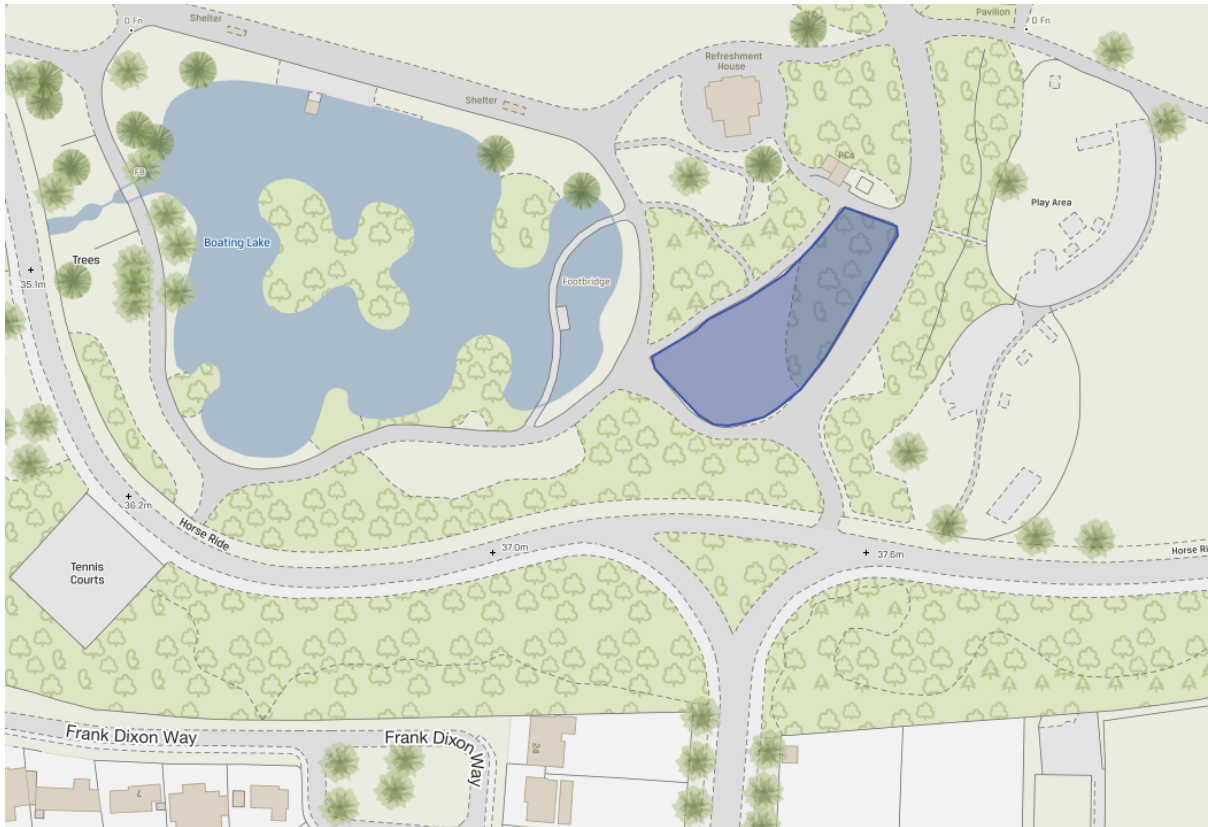
Dulwich Park Forest school area.