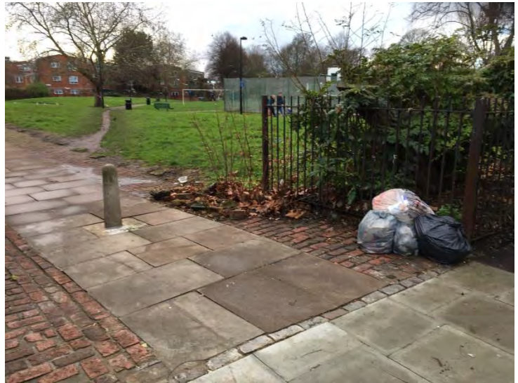
Above: Entrances on Woods Road are uninviting and attract fly tipping